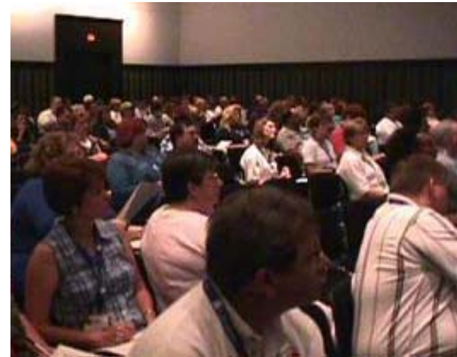
California Department of Housing and Community Development