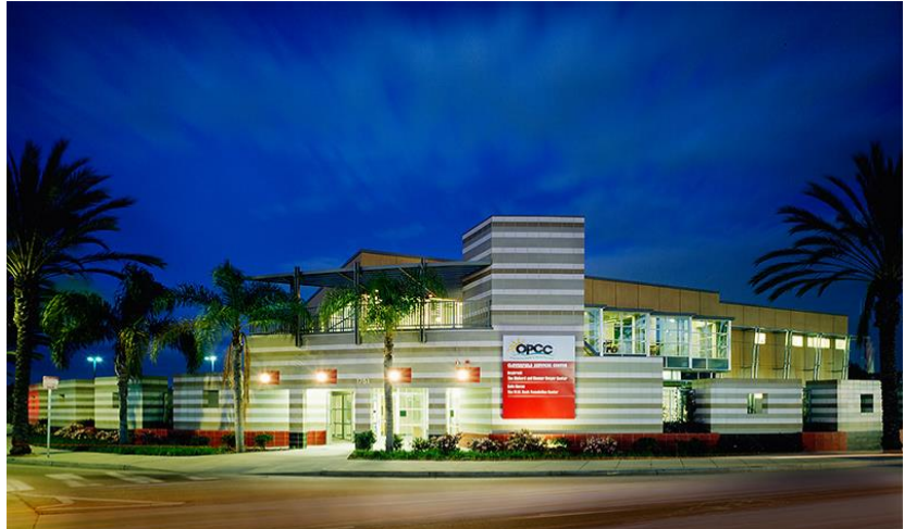
Cloverfield Services Center – Emergency Shelter by OPCC in Santa Monica, CA

Prior to enactment of SB 2, housing element law required local governments to identify zoning to encourage and facilitate the development of emergency shelters. SB 2 strengthened these requirements. Most prominently, housing element law now requires the identification of a zone(s) where emergency shelters are permitted without a conditional use permit or other discretionary action. To address this requirement, a local government may amend an existing zoning district, establish a new zoning district or establish an overlay zone for existing zoning districts. For example, some communities may amend one or more existing commercial zoning districts to allow emergency shelters without discretionary approval. The zone(s) must provide sufficient opportunities for new emergency shelters in the planning period to meet the need identified in the analysis and must in any case accommodate at least one year-round emergency shelter (see more detailed discussion below).