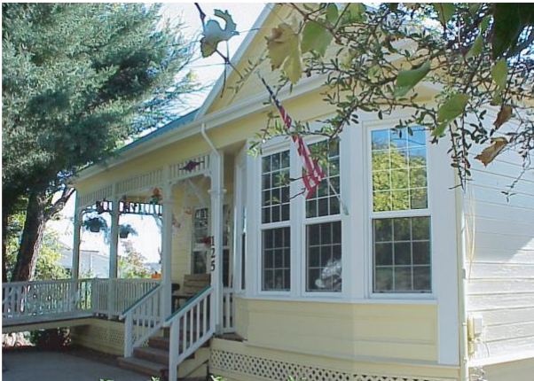
Emergency Shelter – Jackson, California

Requiring a variance, minor use permit, special use permit or any other discretionary process does not constitute a non-discretionary process. However, local governments may apply non-discretionary design review standards.