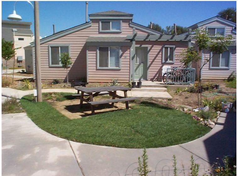
Quinn Cottages, Transitional Housing in Sacramento, CA

If the local government can demonstrate that the multi-jurisdictional agreement can accommodate the jurisdiction's need for emergency shelter, the jurisdiction is authorized to comply with the zoning requirements for emergency shelters by identifying a zone(s) where new emergency shelters are allowed with a conditional use permit.