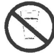
FIGURE 601 INTERNATIONAL SYMBOL

Except as required in Section 601.3.3, nonpotable water systems shall have a yellow background with black uppercase lettering, with the words "CAUTION: NONPOTABLE WATER, DO NOT DRINK." Each nonpotable system shall be identified to designate the liquid being conveyed, and the direction of normal flow shall be clearly shown. The minimum size of the letters and length of the color field shall comply with Table 601.3.2. [HCD 1 & HCD 2] An international symbol of a glass in a circle with a slash through it shall be provided similar to that shown in Figure 601 for all nonpotable water systems.