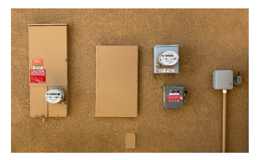
Electrical Set-up for a residential photovoltaic system

CALGreen is an evolving code as new technologies and methods continue to advance in the building industry, thus continued training is necessary to ensure that an up-to-date knowledge base is established and maintained within HCD and the industry.