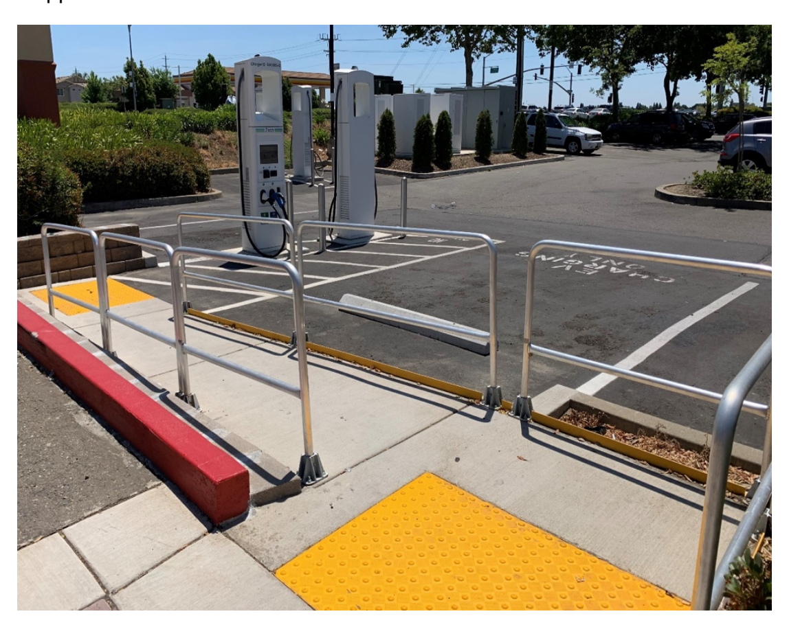
Electrical vehicle charging station on an accessible route